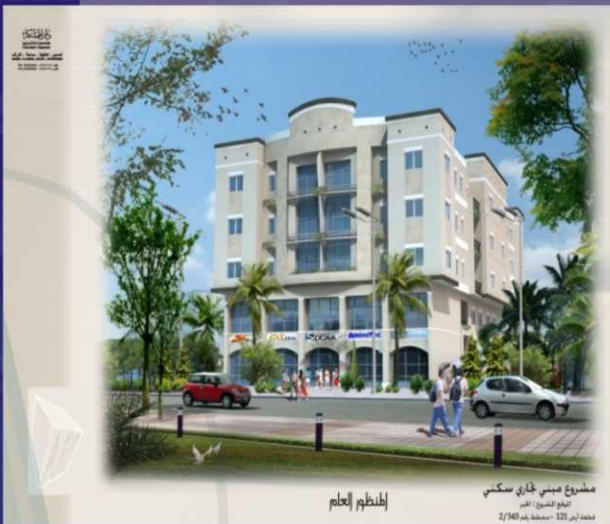
AL WAFA Office Building, Al Khobar, KSA Three storeys- Office Complex 2400 sq. meters