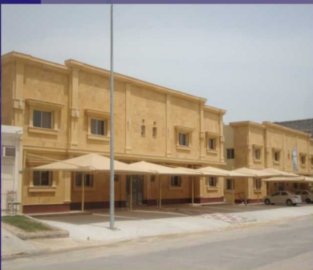
AL WAFA 1 & 2, Al Khobar, KSA Residential Apts., 2500 sq. meters, 2 storey's, 9 rooms in each apt in each.