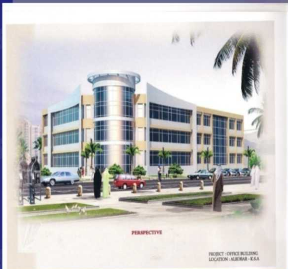
Luxurious Bungalow 1200 sq. meters 2 floors, 5 bedrooms, Living room prayer room.